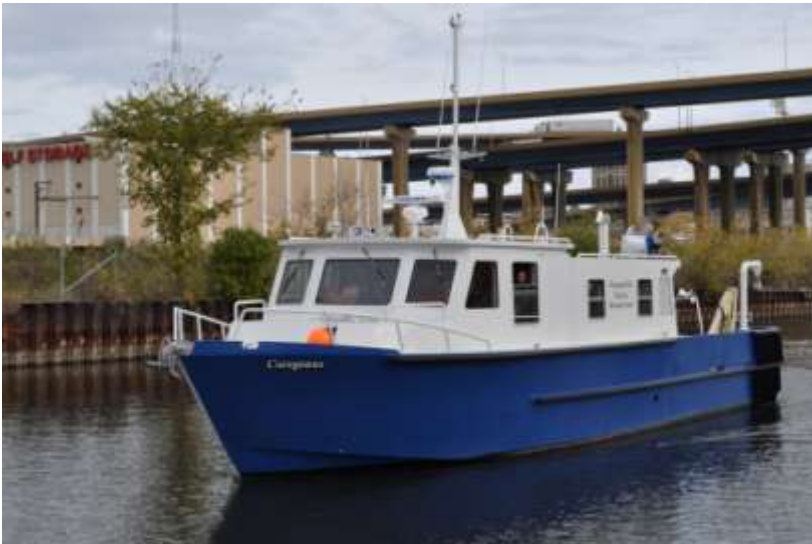
The RV Coregonus has replaced the RV Barney Devine as the Department's Lake Michigan research and assessment vessel.

Presorted Standard U.S. Postage Paid Madison, WI Permit 906